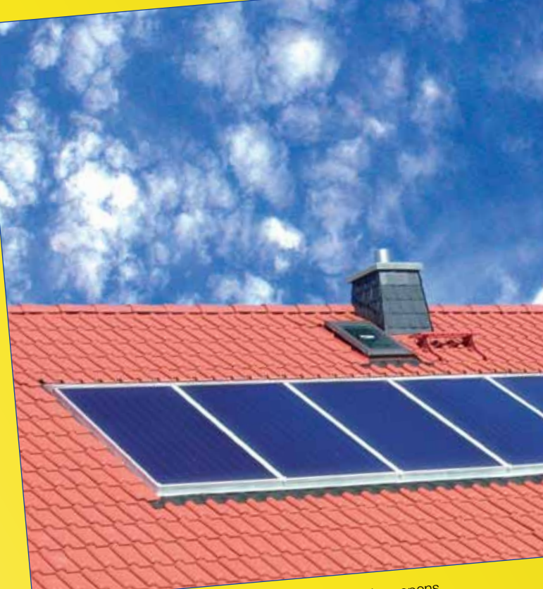
Nothing but sunshine: The Keymark on solar collectors opens the door to new markets.

From a sales perspective more and more customers appreciate the Keymark and in many countries it has become a precondition for financial incentives to solar thermal collectors. The Keymark is the only quality mark for solar thermal products of importance on a European scale and thus facilitates the creation of a single common European market.